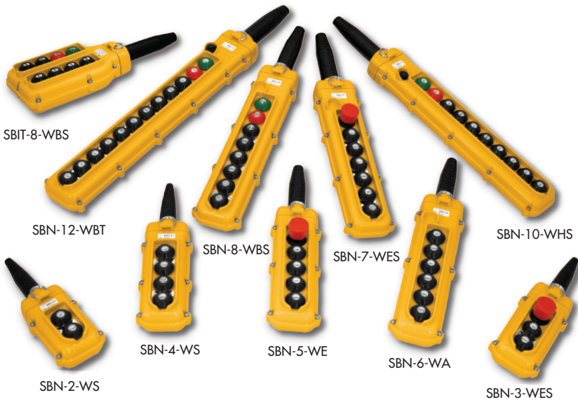
Examples of pendant configurations shown above; contact Magnetek for the entire family of available designs

SBN provides the ultimate in flexibility – select from a wide range of pendant sizes and configurations to meet any application