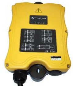
FLEX EX 8/12 RECEIVER

For more information, contact Magnetek Material Handling or your local Magnetek Sales Representative.