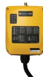
FLEX EX 4/6 RECEIVER

Flex EX receivers were designed with field installation and serviceability in mind. Receivers come prewired with 6' of cable and mounting hardware allowing fast installation. Onboard diagnostic and output LEDs provide system status information useful when installing and troubleshooting. All components are easily accessible and field replaceable. IP66 rated fully sealed receiver enclosures provide you with confidence and protection in the harshest indoor or outdoor environments.